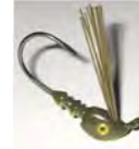
PRO-SWIM JIG FLAT EYE