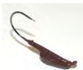
Smallie River Jig #2