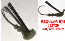
REGULAR EYE #32729 3/0, 4/0 ONLY