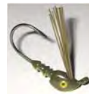
PRO-SWIM JIG FLAT EYE