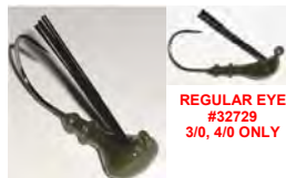
REGULAR EYE #32729 3/0, 4/0 ONLY