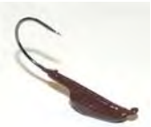
Smallie River Jig #2